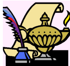
students at Navarro College Mexia

Trunk 'er Treat kicks causes us to come together for the Gospel as does Operation Christmas Child. As we prepare for our Annual Meeting for the Association, we prayerfully must consider all that God is doing in and through our Association and be a part of what is happening through our Association. Just this last month our